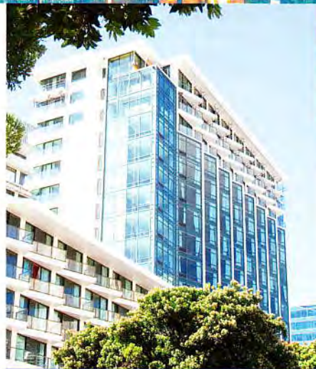
GLOCKWISE FROM TOP LEFT: Tivua Island, Fiji. Outrigger on the Lagoon, Fiji. Holiday Inn, New Zealand. Fatboys Gizo Resort, Solomon Islands. Lakes Resort, New Zealand. Guest room at Parehua Martinborough Country Estate, New Zealand.